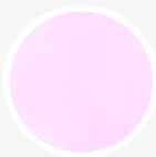
Primary transition metals