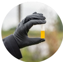
Single Use Test