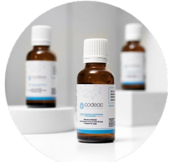
30 ml bottle