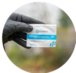
Nuclear Detection wipe